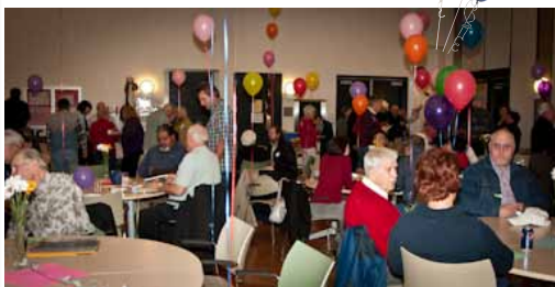
We filled the room.